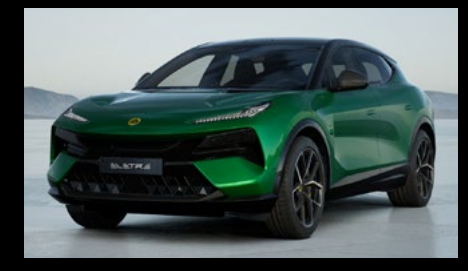
GALLOWAY GREEN OPTION FOR ELETRE S ELETRE R