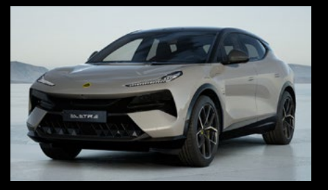
KAIMU GREY STANDARD FOR ELETRE ELETRE S ELETRE R