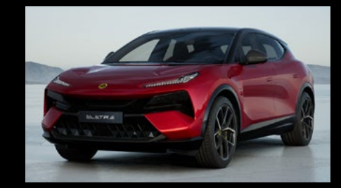
NATRON RED OPTION FOR ELETRE S ELETRE R