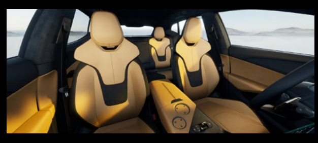
GOLD TAN / BLACK OPTION FOR ELETRE S ELETRE R