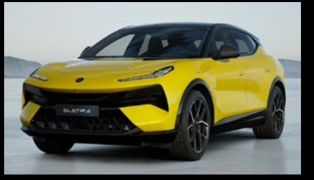
SOLAR YELLOW OPTION FOR ELETRE S ELETRE R