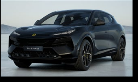
STELLAR BLAC OPTION FOR ELETRE ELETRE S ELETRE R