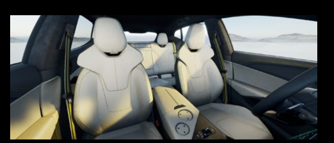
QUARTZ LIGHT GREY / YELLOW OPTION FOR ELETRE S ELETRE R