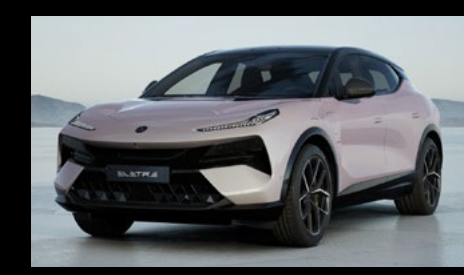
BLOSSOM GREY OPTION FOR ELETRE S ELETRE R