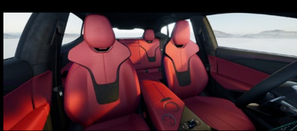
RUBY CARMINE RED / BLACK OPTION FOR ELETRE R