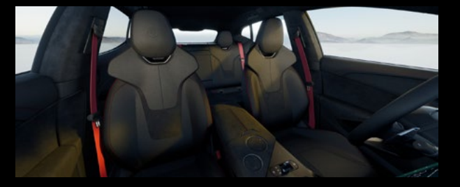
RED / BLAC STANDARD FOR ELETRE NO COST OPTION FOR ELETRE S ELETRE R